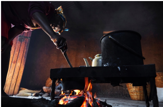
(top left) (top right) (bottom right)

FotoDocument's work has been exhibited in a wide range of venues and festivals including Victoria & Albert Museum, House of Commons, Oxo Tower London, London Design Festival, Brighton Railway Station, Big Green Week, Hove Promenade, Amex Community Football Stadium among others. Their commissioned photographers include emerging artists as well as prominent names in photography and they have worked in partnership with several national organisations/institutions including Tate Modern Exchange, Photoworks, London College of Communication, Bioregional.